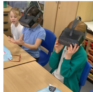
Enhancing our learning about World War 1 & the Romans.