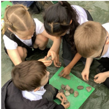
Workshops Linking to our great fire of London topic!