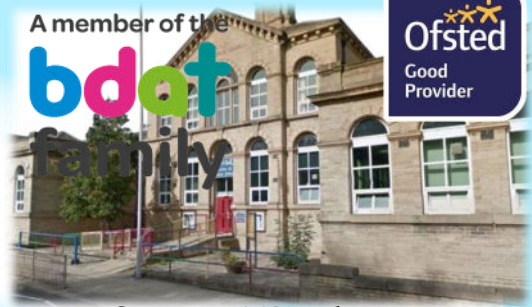
Summer 1 Newsletter

Our vision: "Life in all its fullness" (John 10:10)